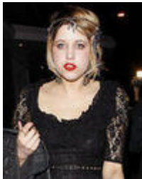
OK! Celebrity News Round Up