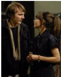
OK! Movie Reviews