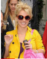
OK! OK! USA